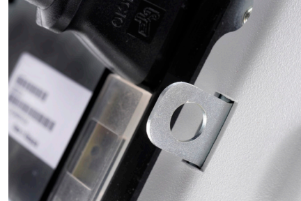
Physical lock mechanism as illustrated

Essential security features: Over-voltage protection (OVP)/ Over-current protection (OCP), keypad lock and physical lock mechanism