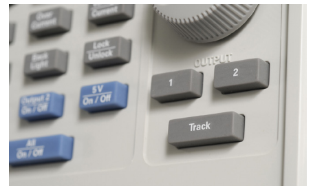
Figure 3. Simplifies Output 1 and Output 2 setup with tracking feature