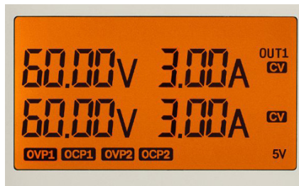
Figure 2. Backlight on/off feature with dual reading (voltage and current) on an LCD display