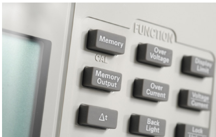
Figure 1. Output sequencing made easy with intuitive keypads

Both models of the U8030 series come with a set of features to suit your needs while remaining easy to use. The LCD screen displays both voltage and current readings in a one-view panel while the all ON/OFF button allows multiple outputs to be controlled simultaneously. Additionally, the auto-track feature simplifies setup between output 1 and output 2. With these, you get a solid bench power supply plus a set of convenient and easy to use features.