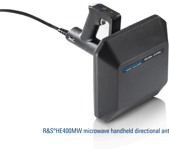
R&S®HE400MW microwave handheld directional antenna with R&S®HE400CEL

The antennas can be switched between normal mode, with a distinct maximum pointing to the front, and delta mode, where the radiation pattern exhibits a steep-edge indent at the boresight. Direction finding based on the minimum signal in delta mode allows users to find the signal source much more accurately and quickly. Both antenna modules are supported by the R&S®HE400 and R&S®HE400MW antenna handles.