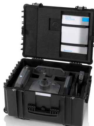
R&S®HE400Z5 transport case suitable for R&S®HE400SHF/HE400SCB