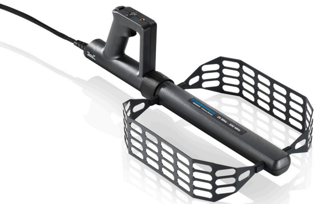
R&S®HE400 handheld directional antenna with R&S®HE400VHF