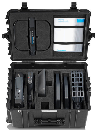
R&S®HE400Z1 transport case