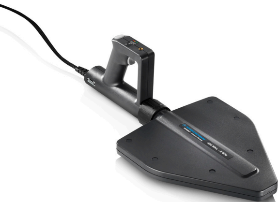
R&S®HE400MW microwave handheld directional antenna with R&S®HE400LP