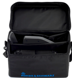
R&S®HE400Z2 transport bag (small)