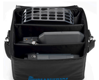
R&S®HE400Z3 transport bag (large)