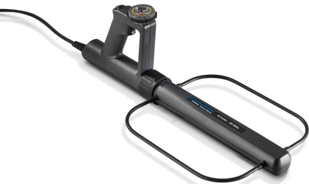
R&S®HE400BC basic handheld directional antenna with R&S®HE400HF

The R&S®HE400 antenna handle supports all antenna modules up to 8 GHz. It is compatible with the R&S®PR200 portable monitoring receiver, the R&S®PR100 portable receiver, the R&S®Spectrum Rider FPH, R&S®FSH4 and R&S®FSH8 handheld spectrum analyzers and the R&S®CableRider ZPH cable and antenna analyzer.