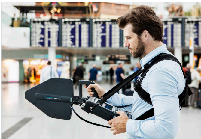
Spectrum monitoring and spectrum surveillance

The antenna modules provide a directional radiation pattern, allowing users to detect and locate a potential interference source based on triangulation of multiple bearings. In highly reflective environments (i.e. indoors), the last few meters to the target are often found more easily by gradually approaching the transmitter (homing mode).