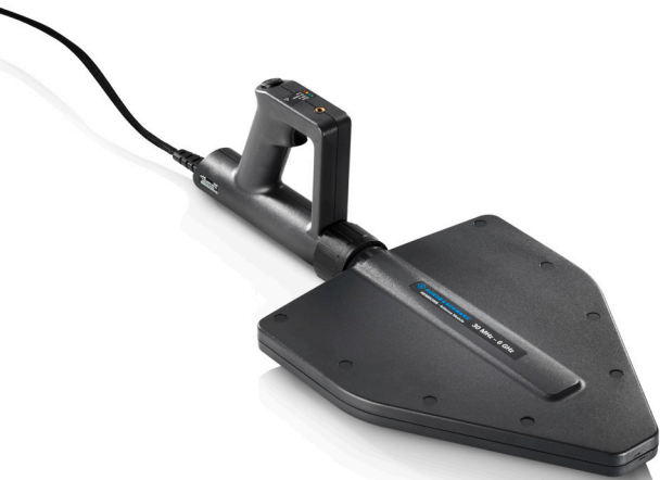
R&S®HE400 handheld directional antenna with R&S®HE400UWB

The R&S®HE400UWB antenna module covers the extremely wide frequency range from 30 MHz to 6 GHz with a single module, addressing the VHF, UHF and lower SHF range. The antenna module operates with all antenna handles.