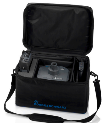
R&S®HE400Z6 transport bag suitable for R&S®HE400SHF/HE400SCB antenna module