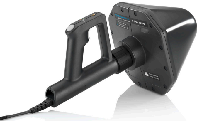
R&S®HE400MW microwave handheld directional antenna with R&S®HE400SHF

The R&S®PR200 portable monitoring receiver will support the full frequency range of the SHF antenna module on request.