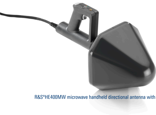
R&S®HE400MW microwave handheld directional antenna with R&S®HE400SCB