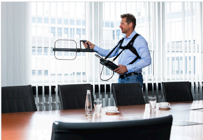
General interference hunting